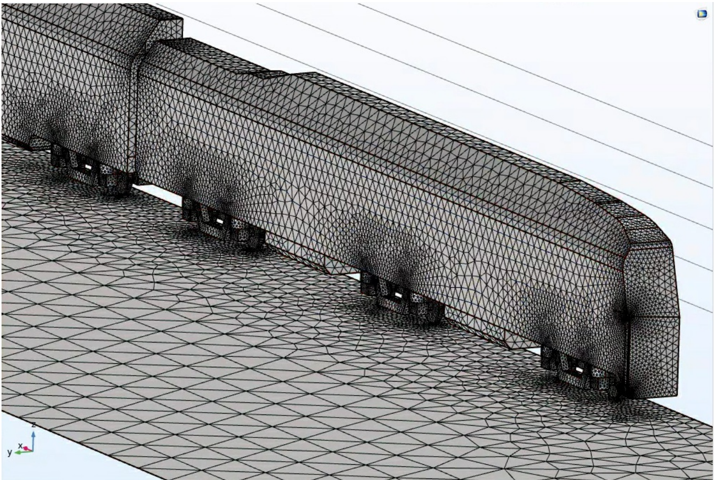
Figure 2 : DDZ meshing domain