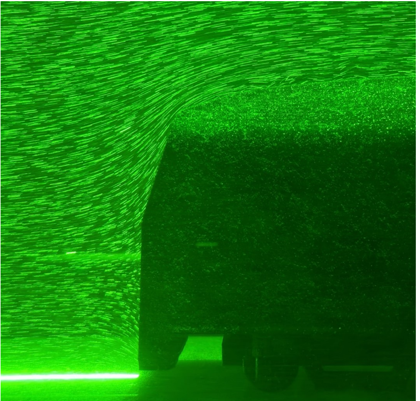
Figure 1 : Water tank experiments